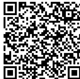
Deltona Middle School Online Payment

T-Shirt Size: Kids – S M L -or- Adult – S M L XL